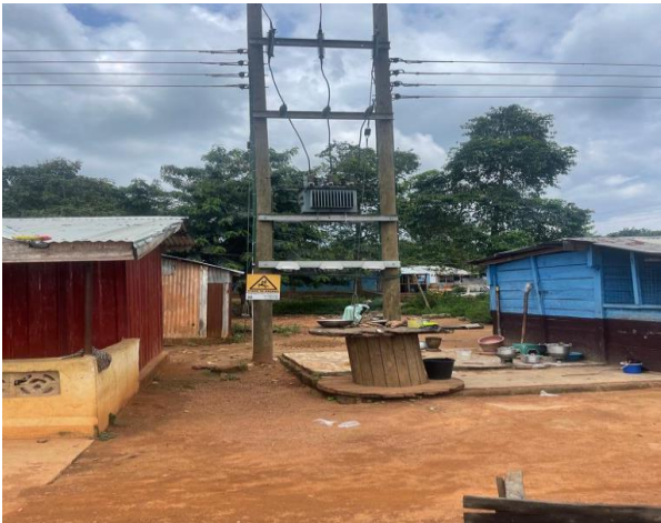
Extension of Electricity to New Communities in Duakwa