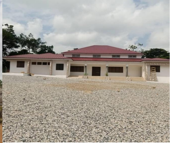
District Magistrate Court at Agona Nsaba