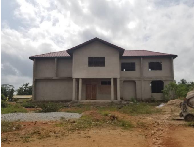
Police Station at Agona Nsaba Nsaba