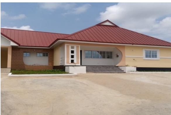
New Magistrate bungalow at Agona Nsaba