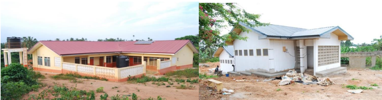
New Kindergarten block at Kokoado