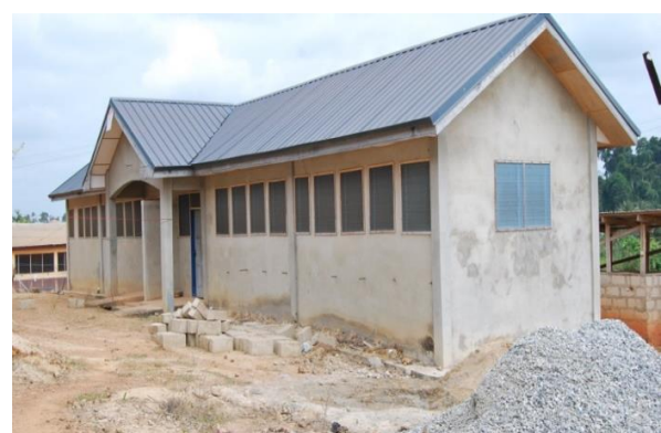
Boys Latrine at Nsaba SHS