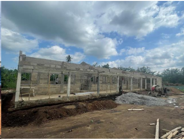
Ongoing construction of 3-unit classroom Block at Tawora